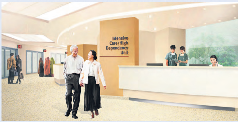
Patients who used to require intensive care but have since improved their conditions to a high dependency level do not need to shift to a different ward.

ICM complex and two roof terraces fitted with selective ICU equipment and supplies will let more stable patients be wheeled outdoors to enjoy some sunlight, greenery and fresh air. These measures will help alleviate the patient's suffering and reduce the chances of ICU psychosis or delirium.