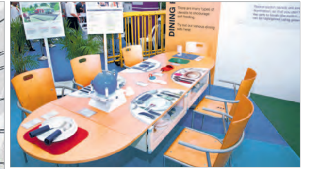
Anti-clockwise from left: Road crossing training area at the mobility park that include road safety features; a table setting of various dining sets to encourage those who face difficulties in self-feeding in a dining room mock-up; a showcase of a barrier-free living room to help those with mobility issues become more independent.

tical use. Patients will be assisted by nursing staff and their caregivers to help them adapt to a home environment even before discharge from the hospital.