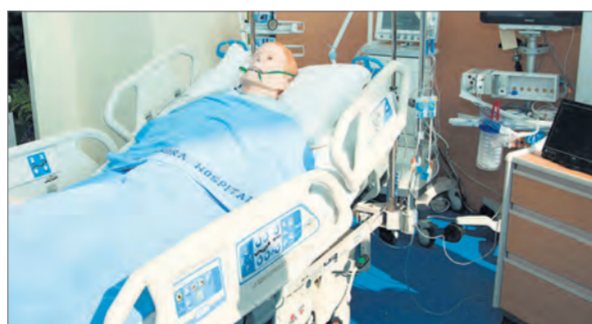
A sneak peek of ICU's features in a life-sized mock-up at the event.

our patients as the main focus. Our twin development of the acute and community hospitals are planned, designed and being built together to bring about seamless acute to sub-acute to rehabilitation care, all on one site."