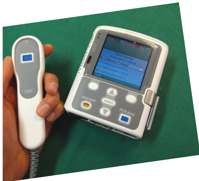
Example of intravenous patient-controlled analgesia