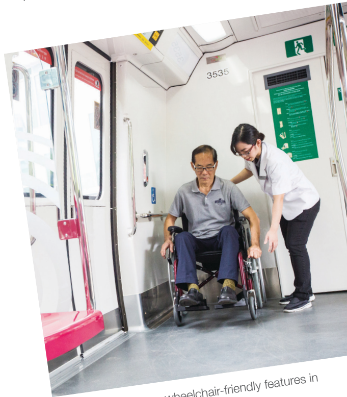
Patients learn to use wheelchair-friendly features in public transport such as the MRT train